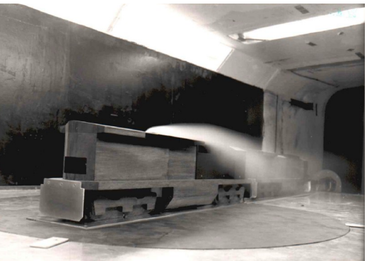
Figure 4: Wind Tunnel Test of Locomotive at 1:15 Scale

In legal cases that rely on technical details, engineers are often called upon to perform engineering analysis or testify as expert witnesses. This can strengthen a client's case significantly and ensure that legal arguments are scientifically sound. As of 2021, Airflow Sciences Corporation (ASC) has consulted on eleven legal cases where the train operators' exposure to diesel exhaust was evaluated (see Figure 1). These cases involve many parameters, including switch yard and trunk routes, different locomotive models, variable speeds and directions for both the wind and the train, as well as the orientation of the locomotive.