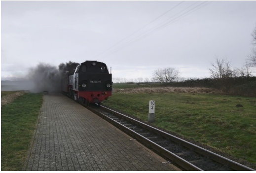
Figure 1: Diesel Exhaust Plume